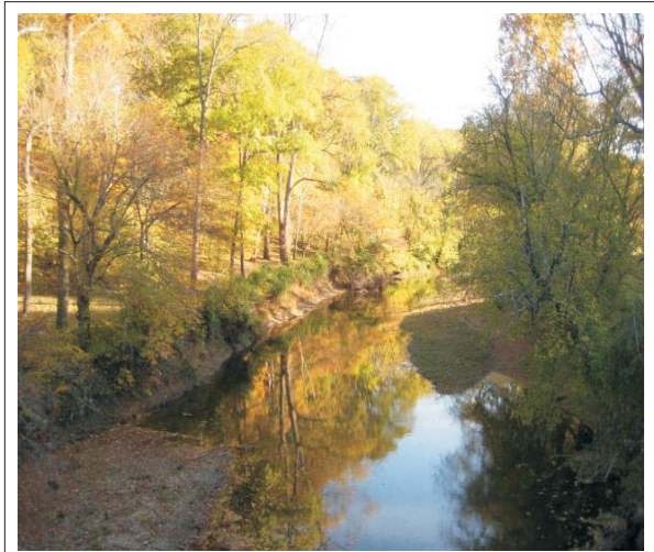
Goose Creek from Foxcroft Rd., Loudoun County